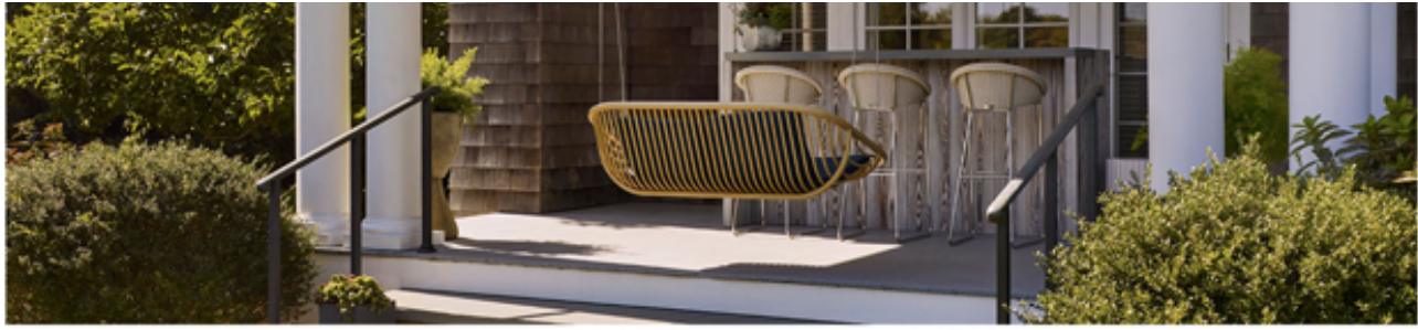
Manhattan design firm Fox-Nahem had a custom bar built of treated cedar and local stone for a home in Southampton, N.Y.

Other design elements to consider: lighting (“you want to create a candlelight effect,” he said), a fountain or bird bath (“the sound of water transports you to tranquility”) and even wind chimes (“another sensory sound to evoke emotions”).