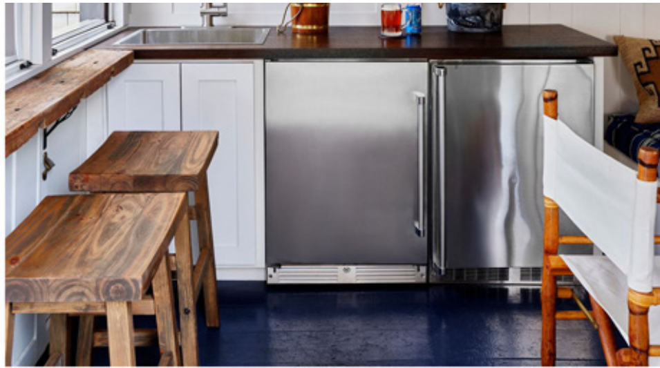
The interior of the Nantucket backyard pub created by Paton, with swing-down awning windows.

On Nantucket, designer Kristin Paton recently transformed a derelict 19th-century ironmonger's shop in the backyard of a home into a meticulously restored gem—a Mini-Me to match the architecture of the circa-1760 main house. The bar hut has windows paned in antique glass, a tiny pitched roof and a trellis for a climbing rose. "The intention is to make it look even more twee, like an antique dolls' house with roses all over," she said.